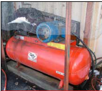
DEVILBISS 20HP COMPRESSOR

WEDNESDAY, JANUARY 17th - 12 NOON Preview: Auction Day, 9 AM-noon (or by appt.) Place: 26167 30A Ave. Aldergrove (Langley) B.C.