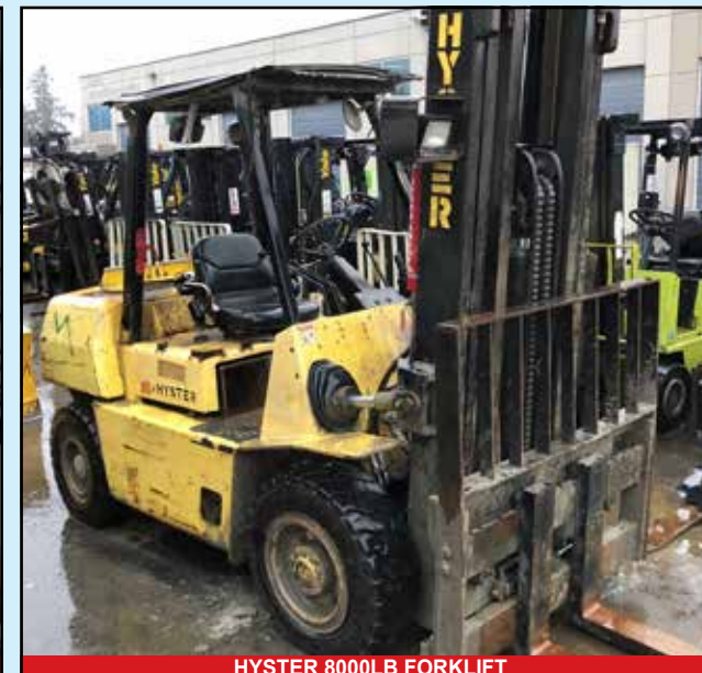
HYSTER 8000LB FORKLIFT