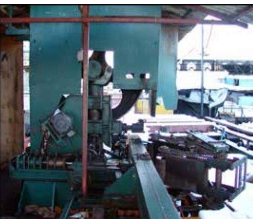
SALEM 62" RESAW