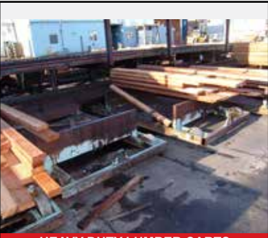
HEAVY DUTY LUMBER CARTS