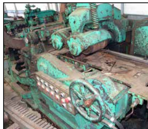
WOODS 134BM 5 HEAD PLANER