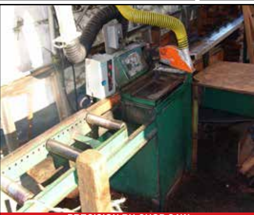
PRECISION RH CHOP SAW

Listing subject to additions & deletions without notice. In person, absentee or phone bidding only at this auction. No Bidspotter service will be offered.