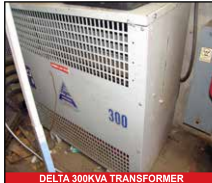
DELTA 300KVA TRANSFORMER