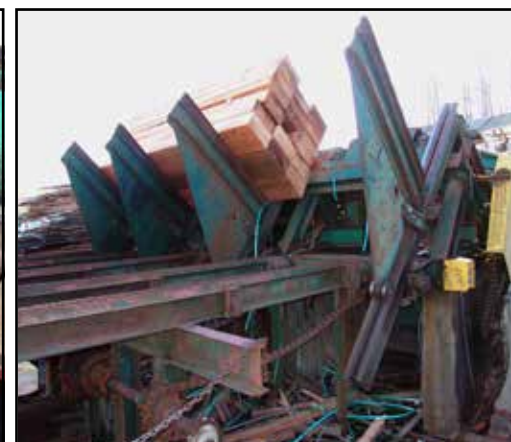
4 ARM TILT HOIST