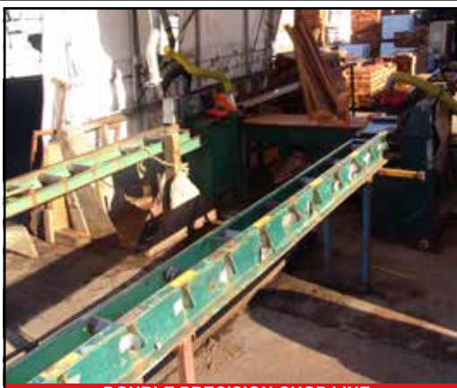
DOUBLE PRECISION CHOP LINE