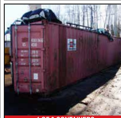
1 OF 3 CONTAINERS

Listing subject to additions & deletions without notice. In person, absentee or phone bidding only at this auction. No Bidspotter service will be offered.