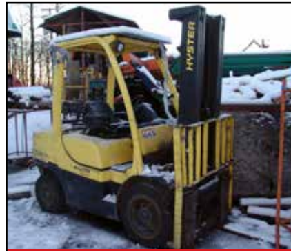
HYSTER H70 7000LB FORKLIFT