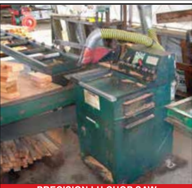
PRECISION LH CHOP SAW

Tradewest is pleased to offer a custom cut lumber remanufacturing operation in Langley, BC. The mill offers resawing, moulder/planer and chopline capabilities. The mill assets can either be moved or a lease option on the land is available. Contact Matt Ardiel @ mardiel@tradewestsales.com or call (604) 530-9351