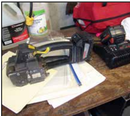
FROMM BATTERY POWERED STRAPPER