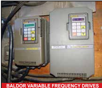
BALDOR VARIABLE FREQUENCY DRIVES