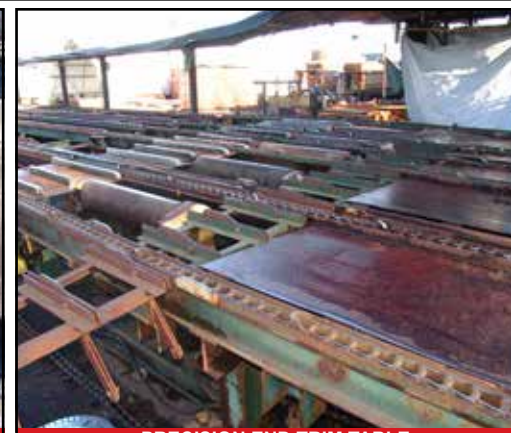
PRECISION END TRIM TABLE