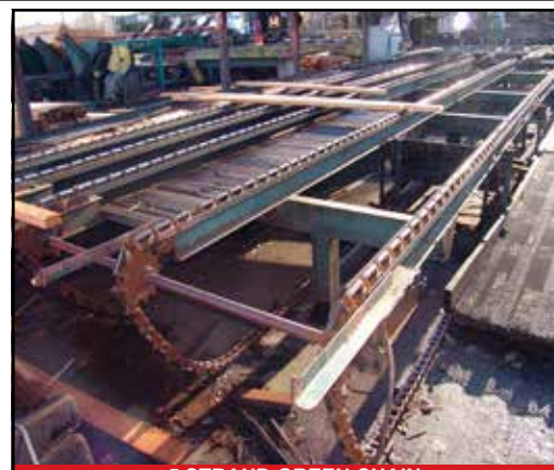
5 STRAND GREEN CHAIN