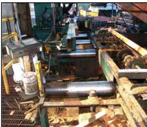
RESAW LINEBAR INFEED