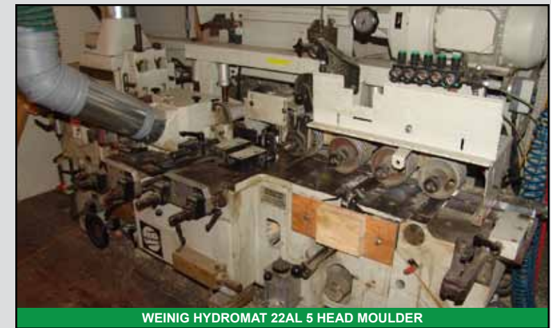
WEINIG HYDROMAT 22AL 5 HEAD MOULDER