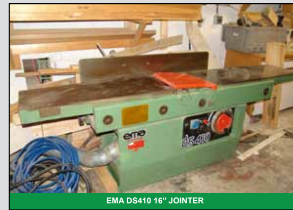
EMA DS410 16" JOINTER