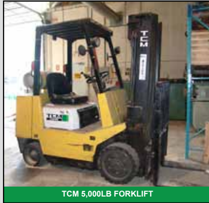
TCM 5,000LB FORKLIFT