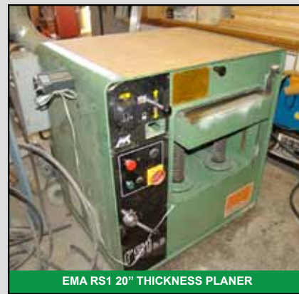
EMA RS1 20" THICKNESS PLANER