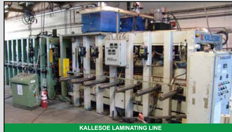
KALLESOE LAMINATING LINE

THURSDAY, OCT. 4th 10 AM Mfrs of Cross Laminated Timber Products