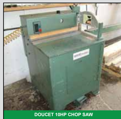
DOUCET 10HP CHOP SAW

Hyster 10,000LB Forklift, Model H90 XLS LPG; Side shift; 172" 3 stage mast; Pneumatic tires • TCM 5,000LB Forklift; Model FCG25N6; LPG; Side shift; 189" 3 stage mast; cushion tires • Spare Forks: Pair 20" x 48" long; Pair 16" x 42" long • '03 Hyster H60XM 6000LB Forklift, LPG, new pneumatic tires, Side shift, 181" triple mast