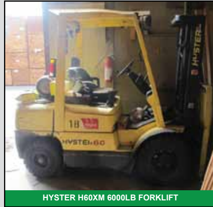
HYSTER H60XM 6000LB FORKLIFT