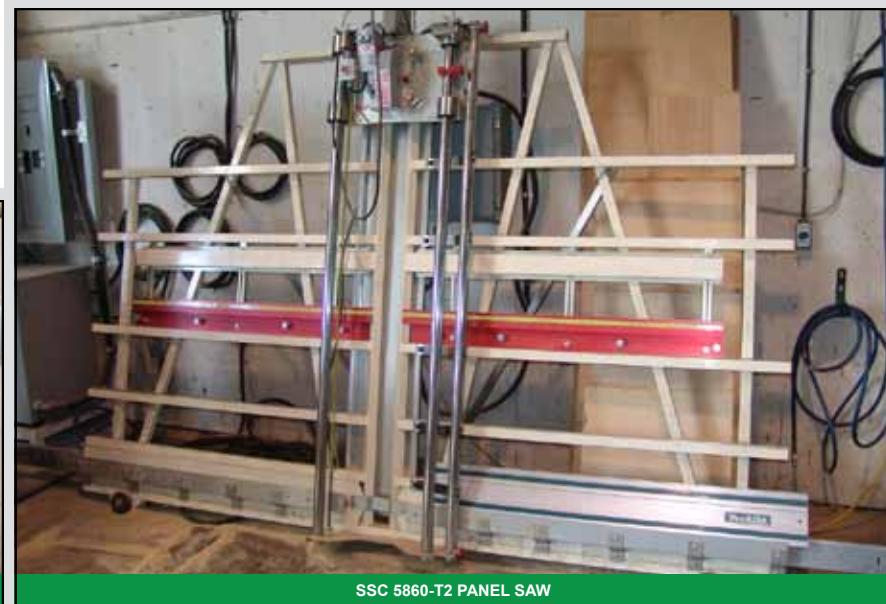
SSC 5860-T2 PANEL SAW