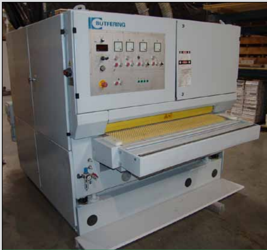
2002 BUTFERRING 4 HEAD POLYSANDER