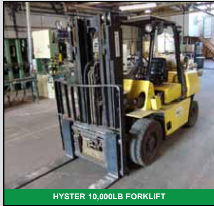
HYSTER 10,000LB FORKLIFT