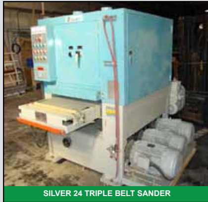
SILVER 24 TRIPLE BELT SANDER