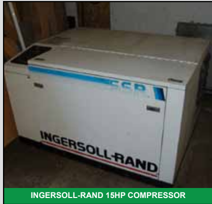
INGERSOLL-RAND 15HP COMPRESSOR