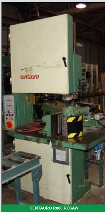
CENTAURO R800 RESAW

NOTE: Listing subject to changes, additions and deletions without notice.