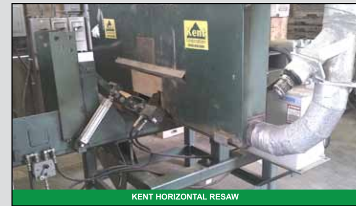
KENT HORIZONTAL RESAW