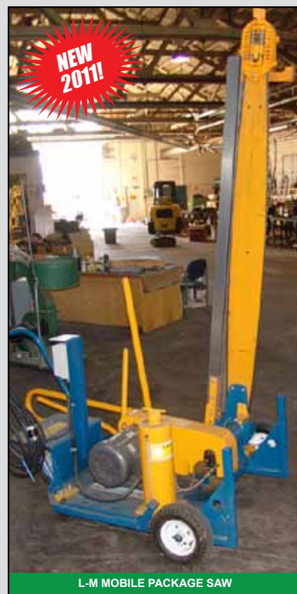
L-M MOBILE PACKAGE SAW