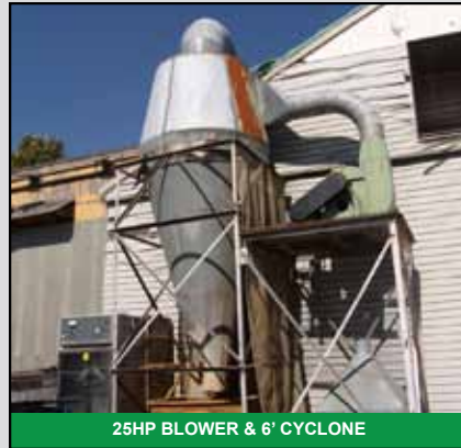
25HP BLOWER & 6' CYCLONE