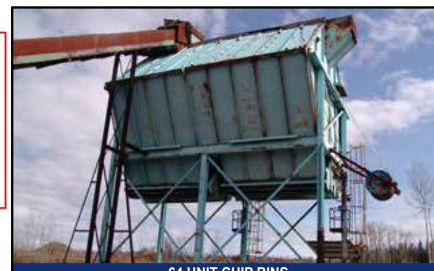
64 UNIT CHIP BINS