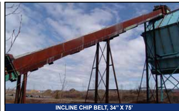
INCLINE CHIP BELT, 34" X 75'