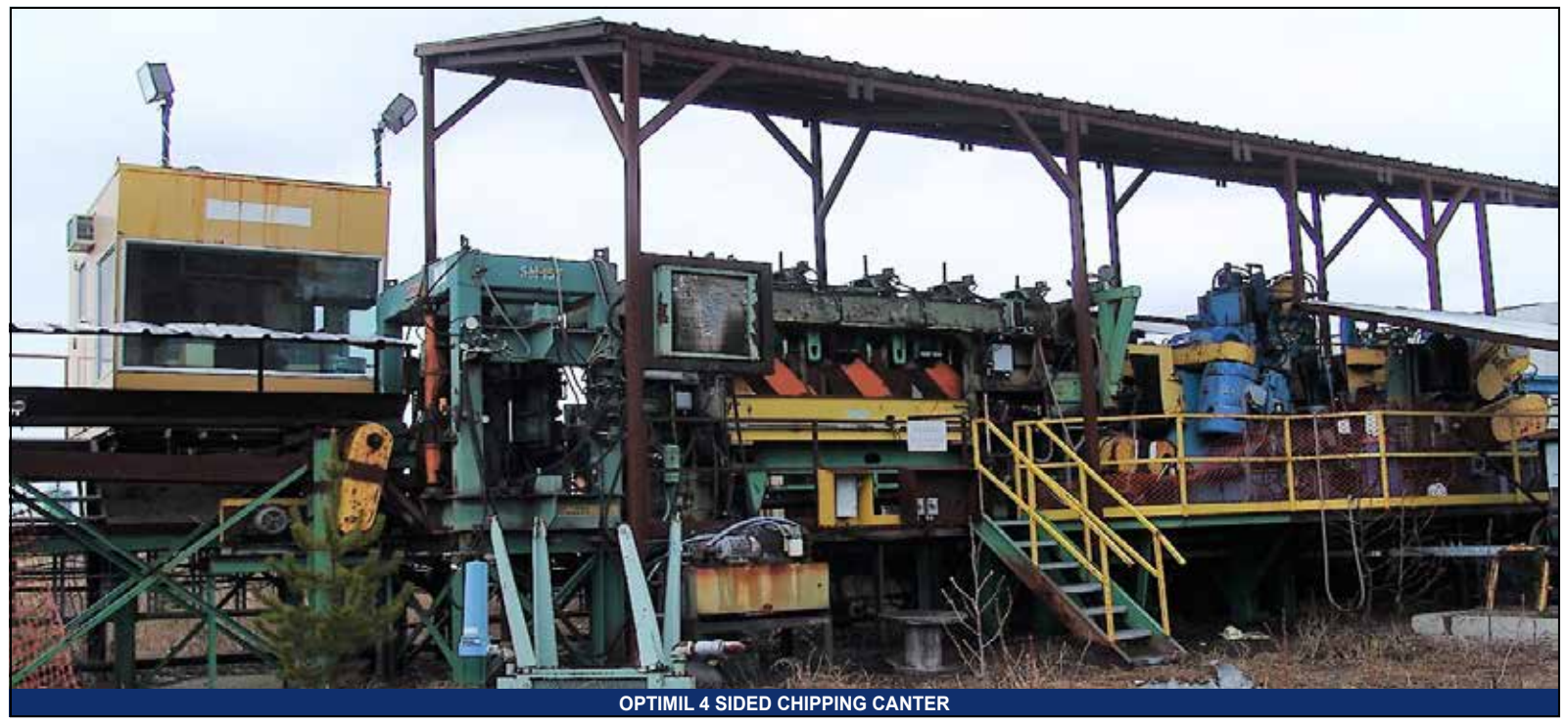
OPTIMIL 4 SIDED CHIPPING CENTER