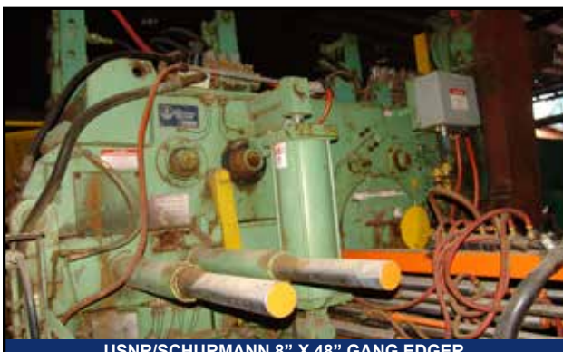
USNR/SCHURMANN 8" X 48" GANG EDGER