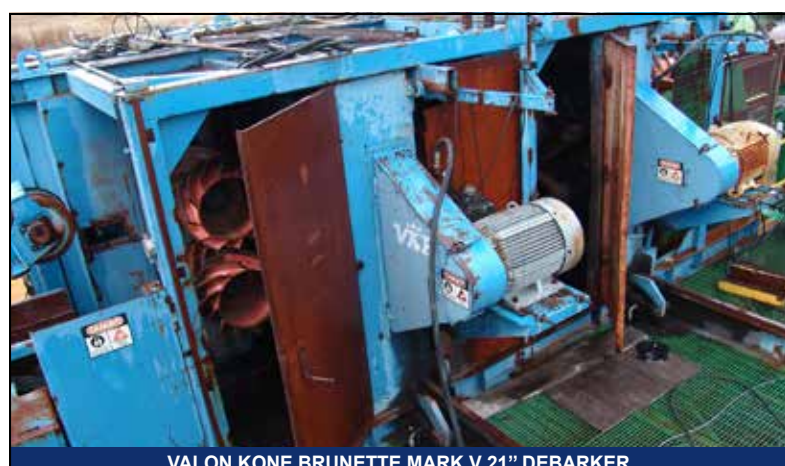
VALON KONE BRUNETTE MARK V 21" DEBARKER