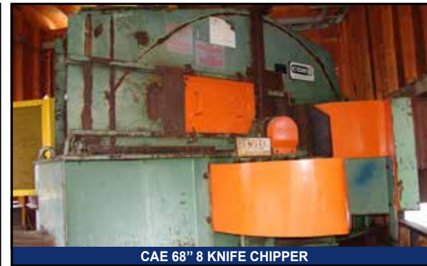
CAE 68" 8 KNIFE CHIPPER