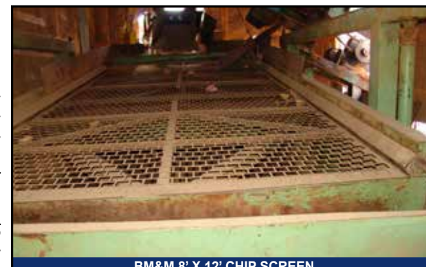
BM&M 8' X 12' CHIP SCREEN