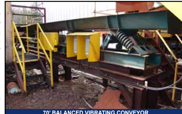
70' BALANCED VIBRATING CONVEYOR