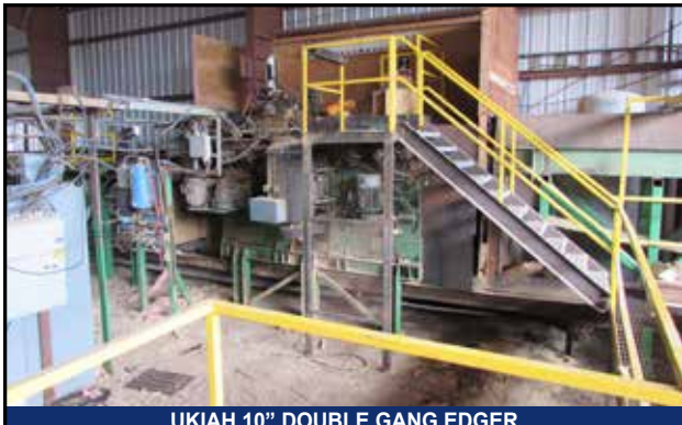
UKIAH 10" DOUBLE GANG EDGER