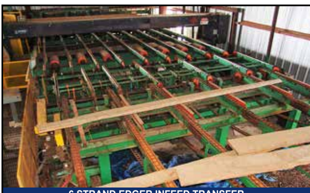
6 STRAND EDGER INFEEED TRANSFER