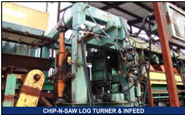
CHIP-N-SAW LOG TURNER & INFEEED