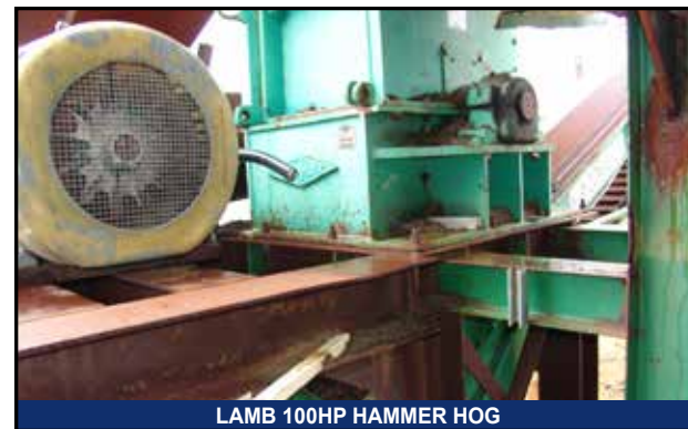
LAMB 100HP HAMMER HOG

FILING ROOM & SHOP Pro-Honer Key Knife Sharpener • IMW grinder • Flat knife grinder, 16" • Powell Guide Dresser • New set of Metric Guides • Stanley Gap Bed Lathe, 4" spindle bore, 3 & 4 jaw chucks • Projex Power Pipe Threader • HD Post Drill Press • General Shaper