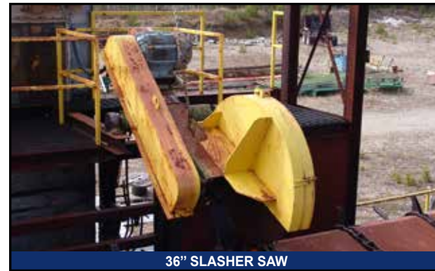
36" SLASHER SAW