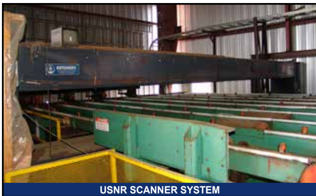
USNR SCANNER SYSTEM

OPTIMIL CANTER LINE CHIP-N-SAW Log Turner, Rexnard drives, (Set for oval infeed) • Single Length Infeed Chain • CHIP-N-SAW 27' Infeed Chain System w/ hold-down rolls, 10HP • Porter Scanner Optimil 4 Sided Chipper Canter, 150HP left, right & top chip heads; 125HP bottom chip head; (4) 200HP quad saw heads; Log size range 4" to 15" (10cm – 40cm), (4) Spline removal feed rolls, Sharp chain outfeed. 15HP; (8) Spiral Roll Outfeed, (5) Hold-down rolls • 6 Strand Cant Drop Outfeed, 14' x 50', w/ drive