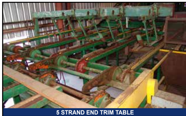
5 STRAND END TRIM TABLE

• Del Schneider 40 + 20HP Hydraulic Power Unit • PLC & Cabinet • VFD Cabinet w/ (2) Powerflex 700 VFD's • 5 Strand Incline Transfer, 18' x 16', w/ 10HP Flender drive • 5 Strand Bar Type Unscrambler, 6'H • Newnes 5 Arm Lumber Stacker, 6 strand w/ Newnes 24 stick placer; 5' wide package • Stacker Switchgear • 5 Strand Package Outfeed, 27' x 15', w/ drive • Precision 14LH Up-acting Chop Saw