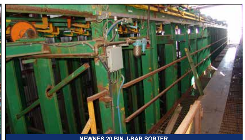
NEWNES 20 BIN J-BAR SORTER

TERMS OF SALE PAYMENT: Full payment day of sale by wire transfer, cash, Debit, Visa, Mastercard or company cheque accompanied by bank letter unconditionally guaranteeing payment on presentation. Maximum $5,000.00 payment by credit card. Full payment by cleared funds must be made before removal of items purchased. Buyer's Premiums will be added to all invoices as follows: On-site bidders - 15%; On-line bidders: 18%. All items in auction are subject to additions, deletions and prior sale. REMOVAL: Removal contractor for all buyers is Blackfox Enterprises Ltd. of Houston, BC. Removal price quotes for all equipment are available upon request from Tradewest at (604) 530-9351 or kardiel@tradewestsales.com.