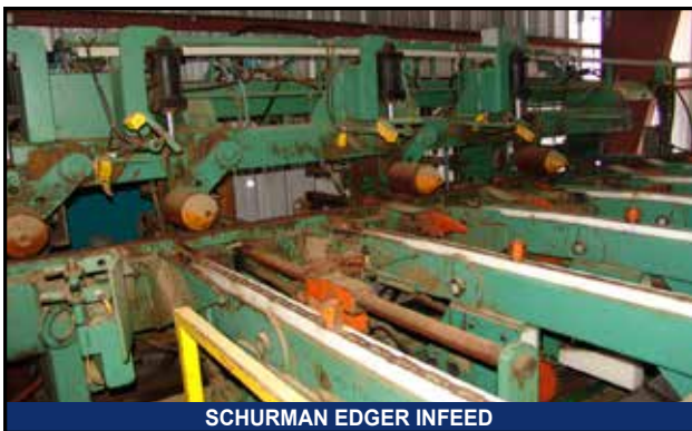
SCHURMAN EDGER INFEEED

LOG INFEEED & DEBARKER 4 Strand Log Infeed Deck, 15' x 60', 20HP 575V • 6 Strand Incline Log Infeed Transfer, flyted chain, w/ 25HP 575V • Valon Kone VK Brunette 21" (53cm) Dual Ring Debarker, Model Mark V-21; s/n 95-600; Max 16' Log, Set up for 18" log; (2) 75HP drives 575V; (2) 40HP Feed roll drives • Log Infeed Conveyor, hourglass flyted chain; 15HP 575V • Porter scanning system • 10HP Hydraulic Power Unit • GS 30KVA Transformer, 600-208/120V • Control Booth & controls • PLC Cabinet • (3) Siemens 30 Amp Switches • Debarker Outfeed Belt, 12' x 100', w/ 20HP 575V drive • 6 Hourglass Rollcase • 6 Strand Log Deck, 18' x 70', w/ drive • 4 Strand Log Deck, 12' x 60', w/ drive • Log Step Feed w/ (6) hourglass even ending rolls • 6 Strand Flyted Incline Transfer to Slasher Saw • 36" Lateral Circular Slashing Saw, 25HP 575V • 70' Flyted Conveyor • 30HP Hydraulic Power Unit • 7 Arm Log Turner • Siemens 200 Amp Switch • Log Deck Sweep controls • Porter Scanning System; $200,000 spent in upgrades • Allen-Bradley 4 Section MCC, 15 switches • Hammond 25 KVA Transformer, 600V-120/240V