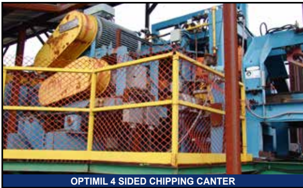
OPTIMIL 4 SIDED CHIPPING CANTER