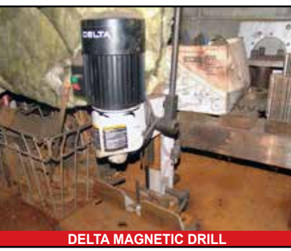
DELTA MAGNETIC DRILL