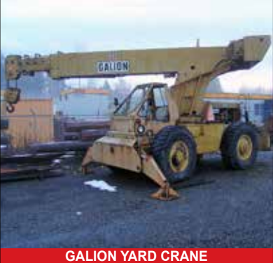
GALION YARD CRANE

Hyster C5D 8,000LB Diesel Forklift, Low mast • Komatsu 6,000LB forklift, LPH, 144" lift, Mod. FG-35-4-G • Galion Yard Crane • (2) Forklift dump bins, wood sides, metal frames