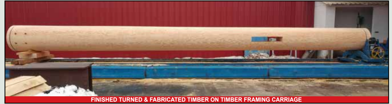
FINISHED TURNED & FABRICATED TIMBER ON TIMBER FRAMING CARRIAGE