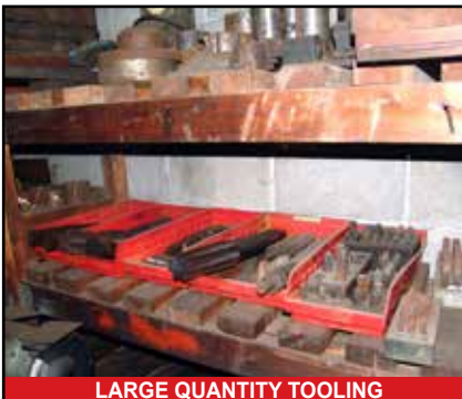
LARGE QUANTITY TOOLING