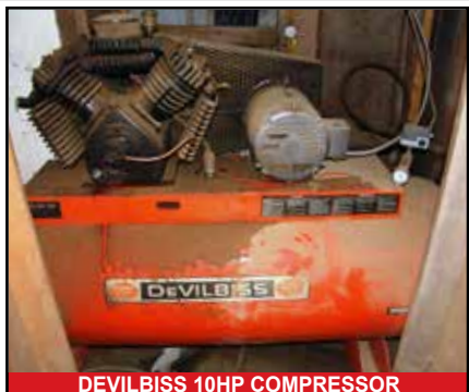
DEVILBISS 10HP COMPRESSOR