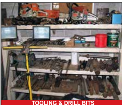
TOOLING & DRILL BITS