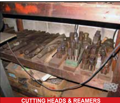
CUTTING HEADS & REAMERS