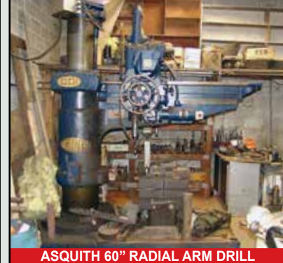
ASQUITH 60" RADIAL ARM DRILL