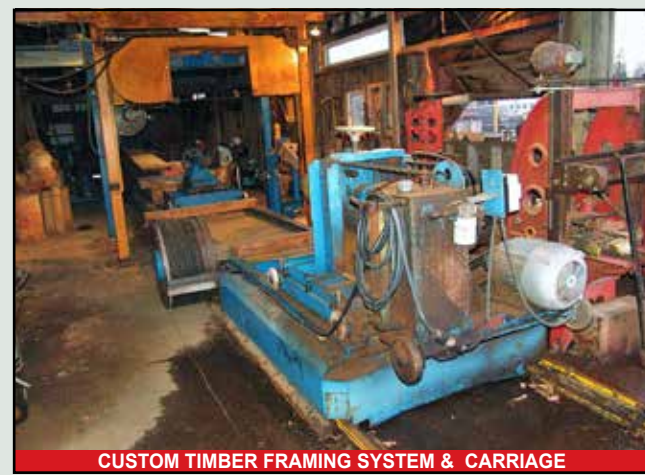
CUSTOM TIMBER FRAMING SYSTEM & CARRIAGE

TERMS OF SALE Payment: Full payment day of sale by wire transfer, cash, Debit, Visa, Mastercard or company cheque accompanied by bank letter unconditionally guaranteeing payment on presentation. Maximum $5,000.00 payment by credit card. Full payment by cleared funds must be made before removal of items purchased. Buyer's Premiums will be added to all invoices as follows: On-site bidders - 15%. All items in auction are subject to additions, deletions and prior sale. Removal: All items must be removed from sale site by 3PM Thursday, February 28th 2018. All items are sold "as is - where is", with all faults. While quantities and descriptions are believed to be accurate, the auctioneer, owner, employees or counsel make no warranties or guarantees either expressed or implied as to the authenticity, genuineness of, or defects in any lot, and will not be held responsible for any advertising discrepancies or inaccuracies. No warranties whatsoever are made as to condition, merchantability or fitness for any use of any item. Please take advantage of our preview and inspection period.