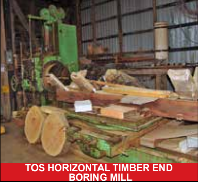
TOS HORIZONTAL TIMBER END BORING MILL

CUSTOM TIMBER FRAMING SYSTEM. DESIGNED & BUILT BY LEGENDARY FOUNDER, ART PAUL System complete with track, carriage, horizontal band saw & circular saw assembly, controls, clamp on devices for drilling, slots, with accessories, etc. Controlled framing for notches, grooves, blind or through slots, deep pockets, small and large holes, tapered shapes, polygonal flats, circular segments and other cuts. Bandsawing to a 36" (90cm) face by 40'+ (12M) lengths.