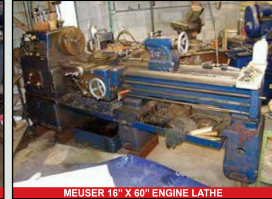
MEUSER 16" X 60" ENGINE LATHE