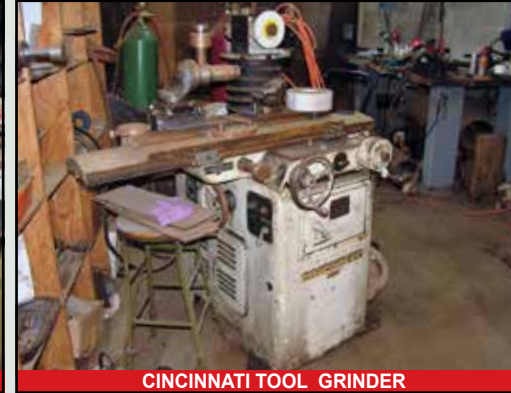
CINCINNATI TOOL GRINDER