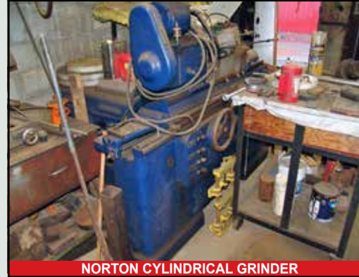
NORTON CYLINDRICAL GRINDER