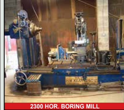
2300 HOR. BORING MILL

Listing subject to additions & deletions without notice. In person, absentee or phone bidding only at this auction. No Bidspotter service will be offered.