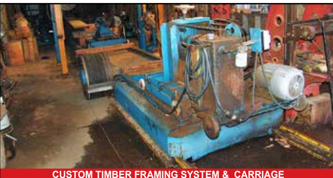
CUSTOM TIMBER FRAMING SYSTEM & CARRIAGE