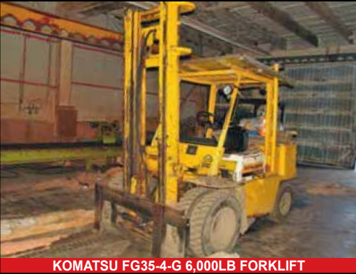
KOMATSU FG35-4-G 6,000LB FORKLIFT