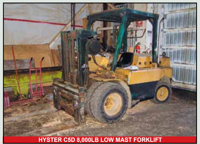
HYSTER C5D 8,000LB LOW MAST FORKLIFT