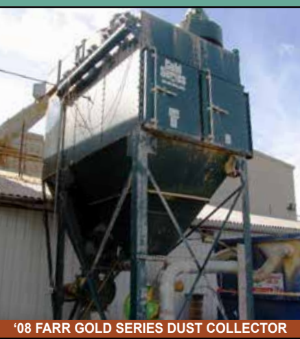
'08 FARR GOLD SERIES DUST COLLECTOR