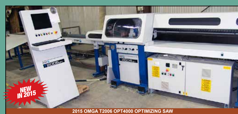
2015 OMGA T2006 OPT4000 OPTIMIZING SAW