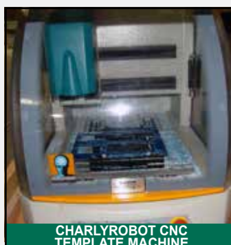
CHARLYROBOT CNC TEMPLATE MACHINE