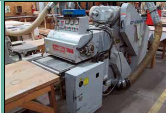
CANTEK SRS-330 STRAIGHT LINE RIPSAW

ELECTRICS Rex 300Kva 600-480V Transformer • Rex 225Kva 600-480V Transformer • Evi 600Y/346- 480Y/277 45Kva Auto Transformer • Siemens 60-200Amp Disconnect Switches