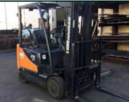
DOOSAN 5000LB FORKLIFT