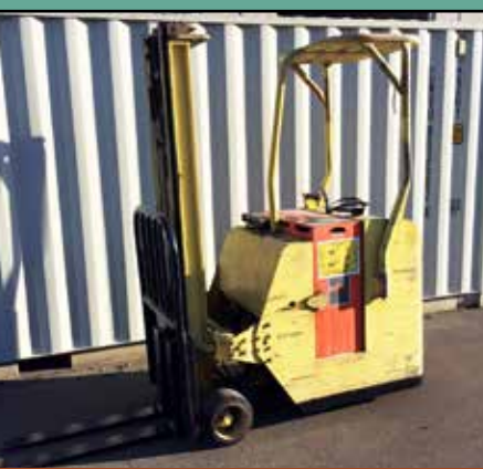
YALE 3000LB ELECTRIC FORKLIFT