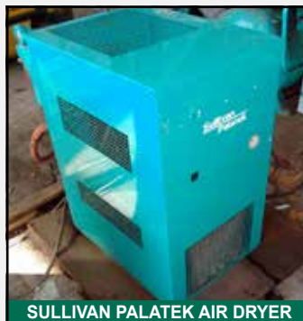
SULLIVAN PALATEK AIR DRYER