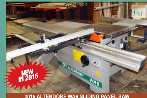
2015 ALTENDORF WA6 SLIDING PANEL SAW

CNC ROUTER 2015 SCM Rotech Accord 20FX CNC Router, XYZ, 3680X1380, FX Matic Worktable W/ Fully Automated Rails, Xilog Plus Software, S/N AAN/003175; Becker 8.5Kw Vacuum Pump, Photocel Safety System, "Tekpad" Mobile Console, Rapid 24 Tool Magazine, (Paid $208K In 2015)