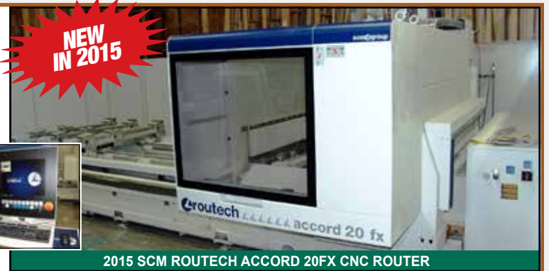
2015 SCM ROUTECH ACCORD 20FX CNC ROUTER

Place 8081 132nd St., Surrey, B.C. (Vancouver)