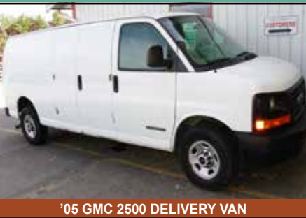
'05 GMC 2500 DELIVERY VAN