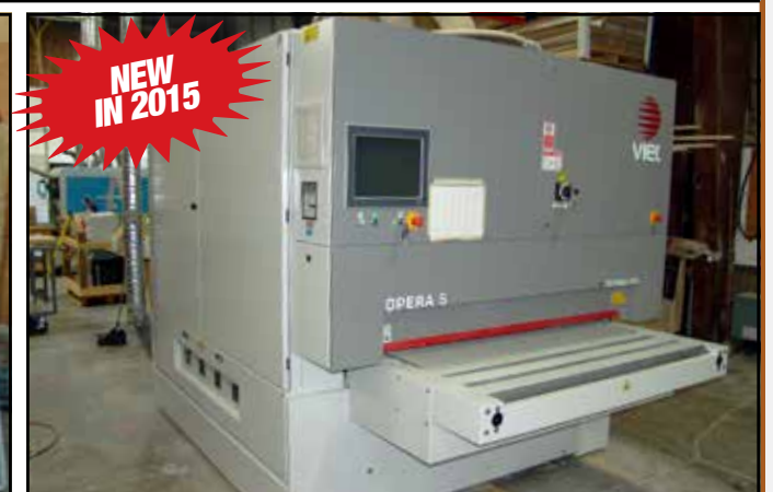
2014 BIESSE VIET 4 HEAD SANDER

Another Auction With Integrity By Tradewest Asset Solutions Inc.