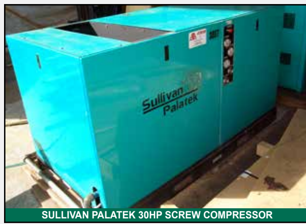
SULLIVAN PALATEK 30HP SCREW COMPRESSOR