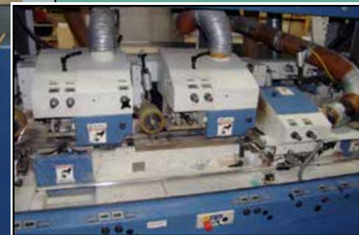
CANTEK GT 635 ARD DOUBLE HEAD PLANER