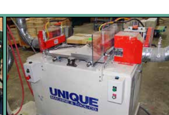
'07 UNIQUE 311 DOUBLE COVE MACHINE