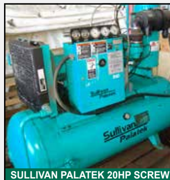
SULLIVAN PALATEK 20HP SCREW