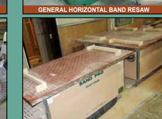
(3) '15 SANDPRO DOWN DRAFT TABLES