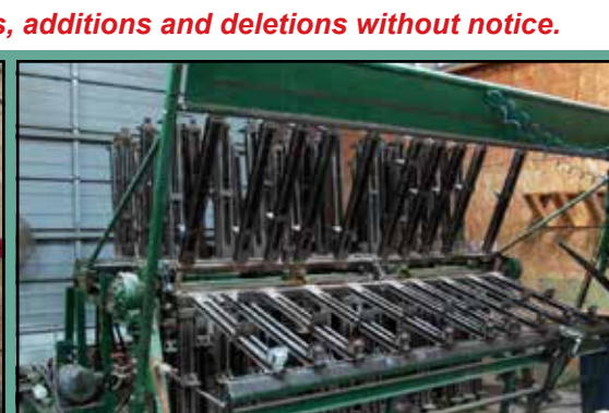
DOUCET CLAMP CARRIER