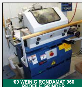
'09 WEINIG RONDAMAT 960 PROFILE GRINDER