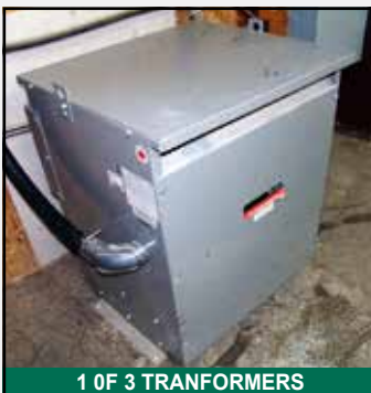
1 OF 3 TRANSFORMERS