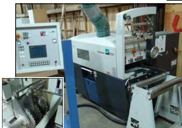
'09 WEINIG RAIMANN PROFIRIP KM310M MULTIRIP SAW