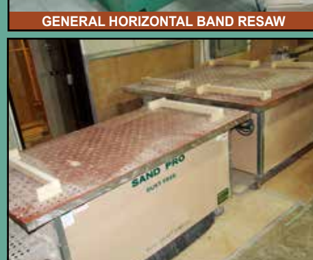
(3) '15 SANDPRO DOWN DRAFT TABLES