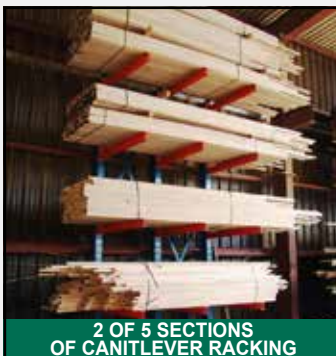
2 OF 5 SECTIONS OF CANITLEVER RACKING