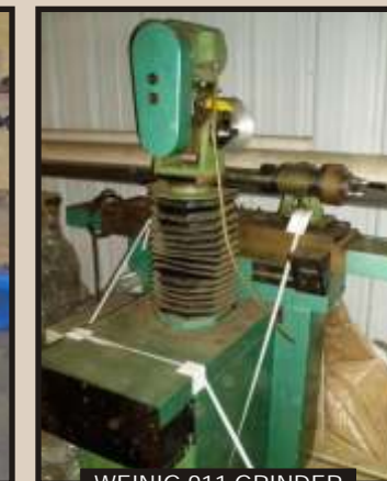
WEINIG 911 GRINDER