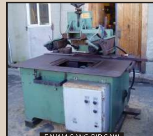
EAVAM GANG RIP SAW

ABSENTEE BIDS If you are unable to attend this auction, you may register a confidential bid with Tradewest. Tradewest will exercise your bid at the auction, ensuring that you pay only the amount the item sells for, not necessarily the full amount of your bid. Absentee bids are permitted only with pre-registration and receipt by Tradewest of a 25% deposit. Call Tradewest for complete information.