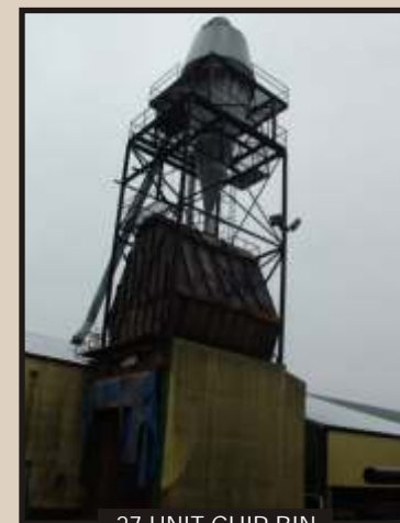
27 UNIT CHIP BIN