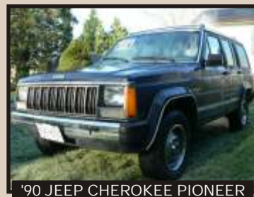
'90 JEEP CHEROKEE PIONEER

Forklift, propane, 146" lift, 2 stage, Solid cushion tires, S/N BGF03A40V • Allis 3,000 LB Electric Forklift • Spare forklift forks • Forklift Boom • Vehicles: 1988 BMW 735i Sedan, loaded • '79 Ford 1 Ton Van Truck, 12' Box, V8 Major work done • 1989 Ford Lariat 4 x 4 Pickup; Loaded, 260,000 KM, air cared • '90 Jeep Cherokee Pioneer 4 x 4 SUV; 4L 6 cyl; 215,000km; loaded; new batt, alt, rad, centre console; Re & re'd rear seal & rocker cover gaskets maintained by mechanic owner • '92 Chev Pickup, Propane • '88 Dodge Aries K, 193,000 Kms, 2.5L 4 Cyl., s/roof, body & mech. good • Crestliner 18.5' aluminum Boat, Merc 90HP outboard; Steering Console, Canopy; New Prop, floor & carpet; Fresh water only