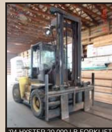
'94 HYSTER 20,000 LB FORKLIFT