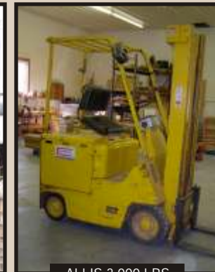
ALLIS 3,000 LBS

FORKLIFTS: '94 Hyster H210XL 20,000LB Forklift; s/n E007D02043R; Diesel, 169" lift; 2 stage mast w/ side shift, enclosed cab • '87 Hyster H180 18,000LB Forklift; s/n C007D027694; diesel; 2 stage mast; 212.5" lift; Side shift; Enclosed cab; Dual front tires; Monotrol 3 sp. Trans. • Clark 25,000LB Forklift; Model C500Y5250D; 210" Fork height; Lowered Mast height: 159"; Side shift; Power shuttle transmission; Full cab; Diesel; 51" pallet forks • '98 Hyster H90XL2S 8,000lb Forklift, s/n G005D13794W; Diesel; 169.5" lift; 2 stage mast w/ side shift; (Unit #14) • '90 Hyster H90XL2S 12,000LB Forklift, s/n F5D-4000L; diesel; 169.5" lift; 2 stage mast; side shift; (Unit #12) • '89 Nissan 9000 LB