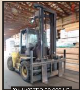
'94 HYSTER 20,000 LB