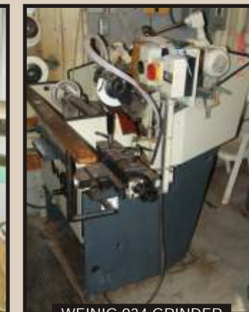
WEINIG 934 GRINDER