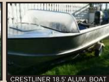
CRESTLINER 18.5' ALUM. BOAT