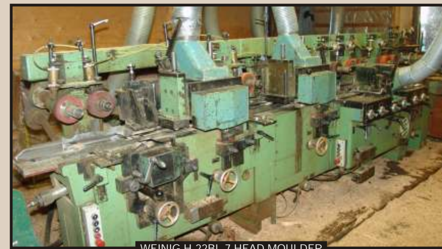
WEINIG H-22BL 7 HEAD MOULDER