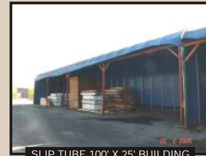
SLIP TUBE 100' X 25' BUILDING