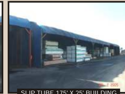
SLIP TUBE 175' X 25' BUILDING