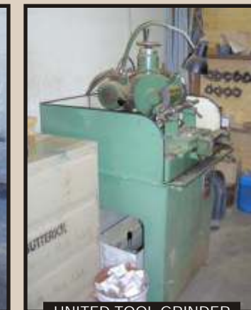
UNITED TOOL GRINDER