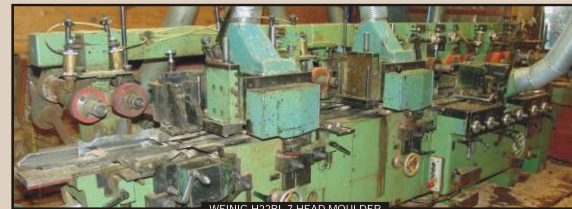
WEINIG H22BL 7 HEAD MOULDER