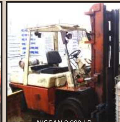
NISSAN 9,000 LB