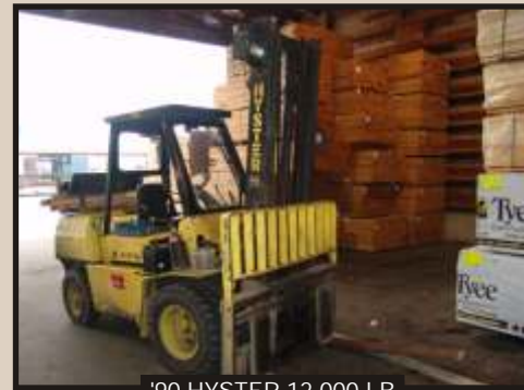
'90 HYSTER 12,000 LB