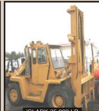
'CLARK 25,000 LB