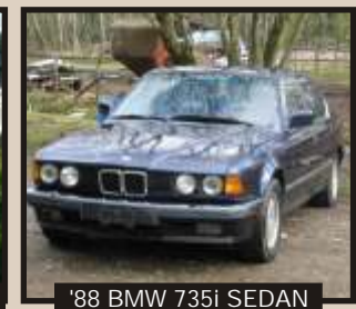
'88 BMW 735i SEDAN