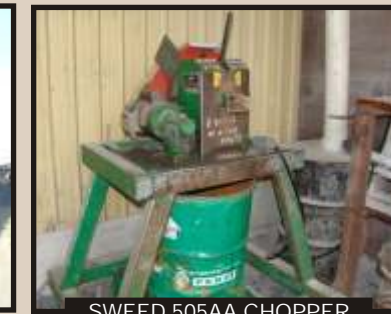
SWEED 505AA CHOPPER

ABSENTEE BIDS If you are unable to attend this auction, you may register a confidential bid with Tradewest. Tradewest will exercise your bid at the auction, ensuring that you pay only the amount the item sells for, not necessarily the full amount of your bid. Absentee bids are permitted only with pre-registration and receipt by Tradewest of a 25% deposit. Call Tradewest for complete information.