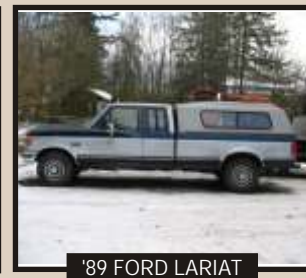
'89 FORD LARIAT