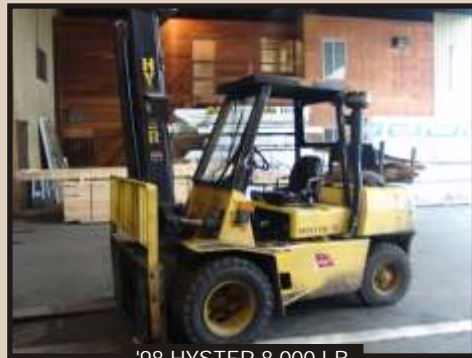
'98 HYSTER 8,000 LB