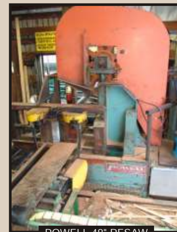
POWELL 48" RESAW