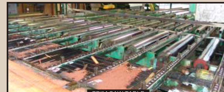
TRIM SAW TABLE