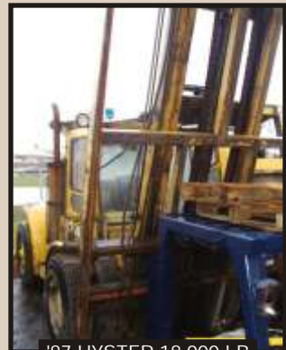
'87 HYSTER 18,000 LB